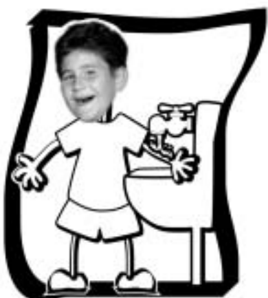
Cool the burn in cool water.

Hot Things are things that can burn you.